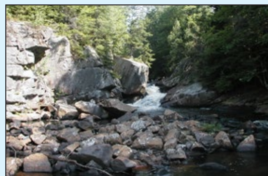
The Little River Falls

At the bottom of a small hill is the outlet of Star Lake. It drains toward the Little River and the three Readway Ponds. The dirt road before the outlet is an interesting side trip, in a mile or so it leads over a steep glacial landscape to the Little River falls, or you may take a detour to